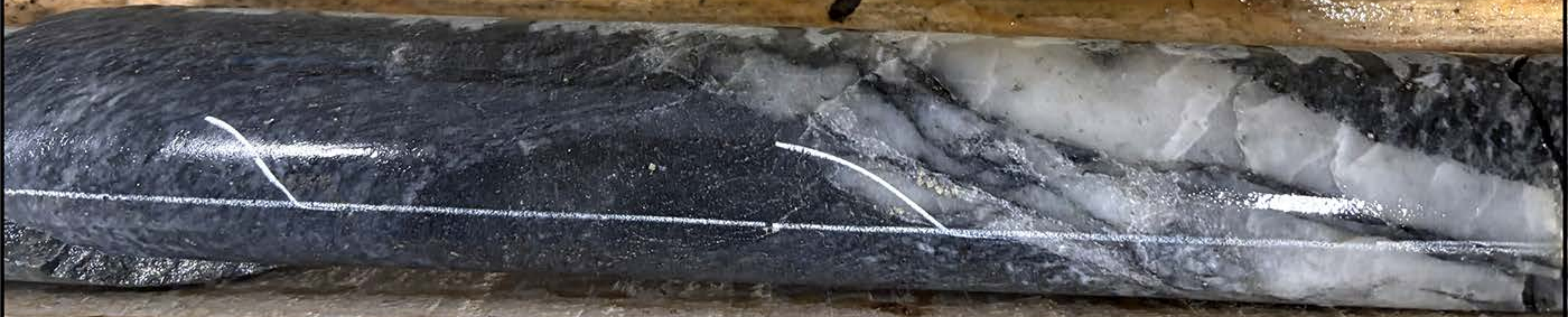
CL26032 361.4m sheared qtz-carb vein (38.1 g/t Au)