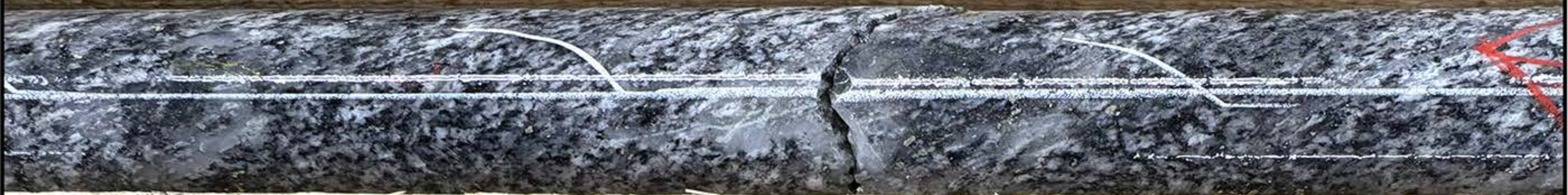
CL26032 sheared granodiorite with qtz-carb & sulfide veins